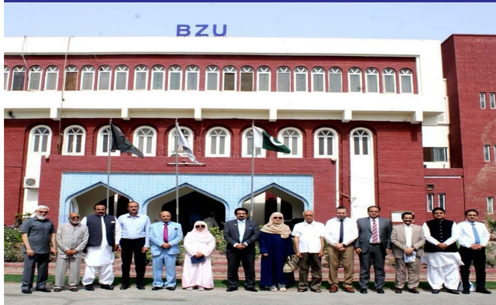
Chairman PHEC meets with VCs of South Punjab Universities