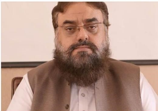
An Encouraging Session for Position Holders