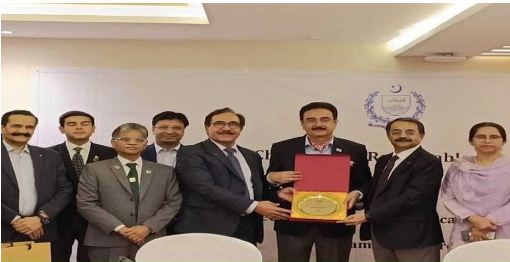
A Tobacco and Nicotine Free Conference in Educational Institutions Organized by Academy of Health Sciences at Islamabad