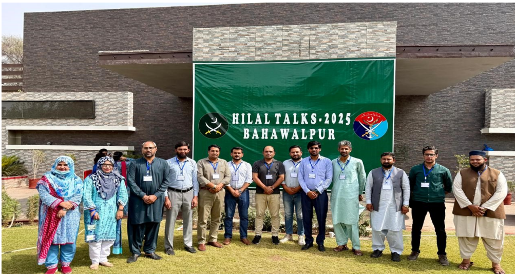
CUVAS Participated in Hala talk-2025 at Bahawalpur