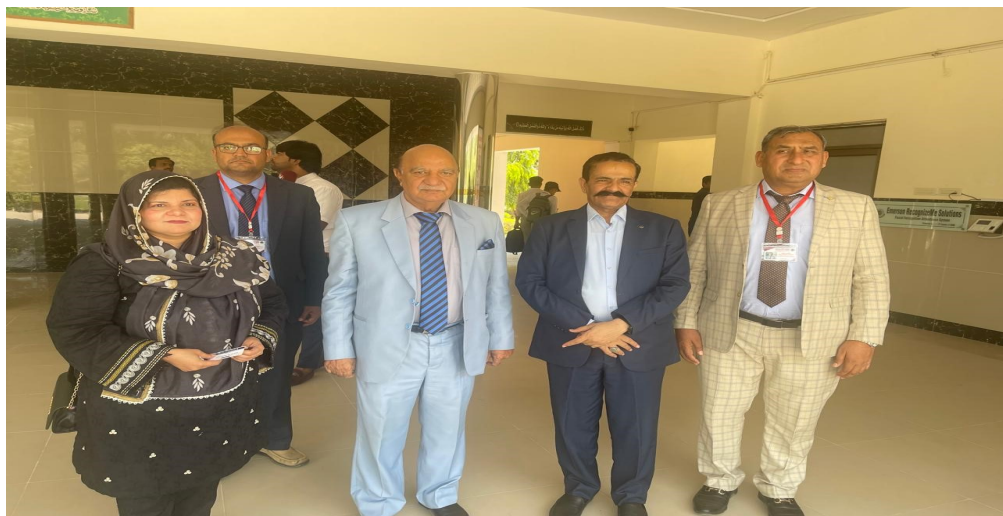
Techno Molecules Conference 2025 at Multan