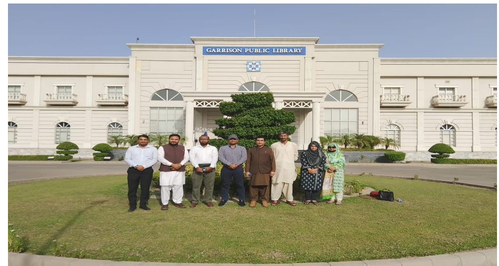
CUVAS Participated in Hala talk-2025 at Multan