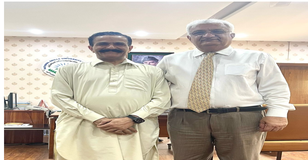
A meeting with Vice Chancellor of National Skill University, Islamabad