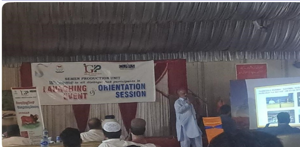
Launching Ceremony, IGP, CUVAS, Bahawalpur. Al-Maida Restaurant, Khanewal.