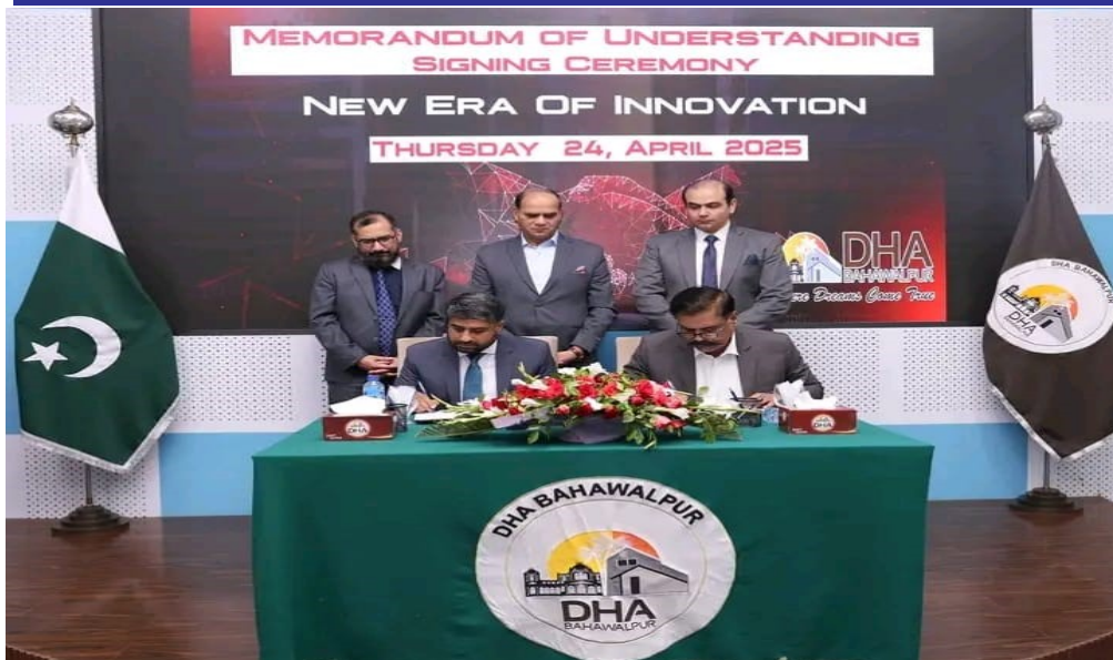
MoU signing ceremony between INNOVISTA CHOLISTAN and Cholistan University of Veterinary & Animal Sciences Bahawalpur