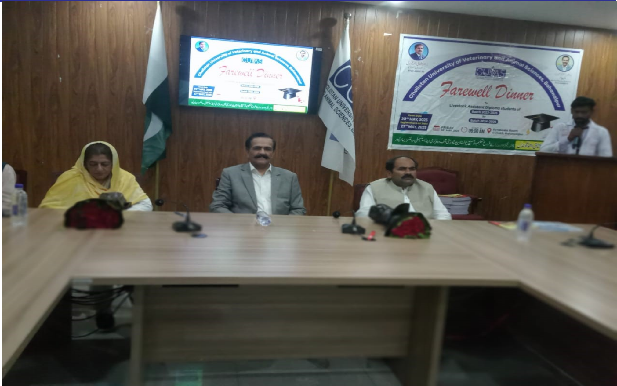
Farewell Dinner of Livestock Assistant Students