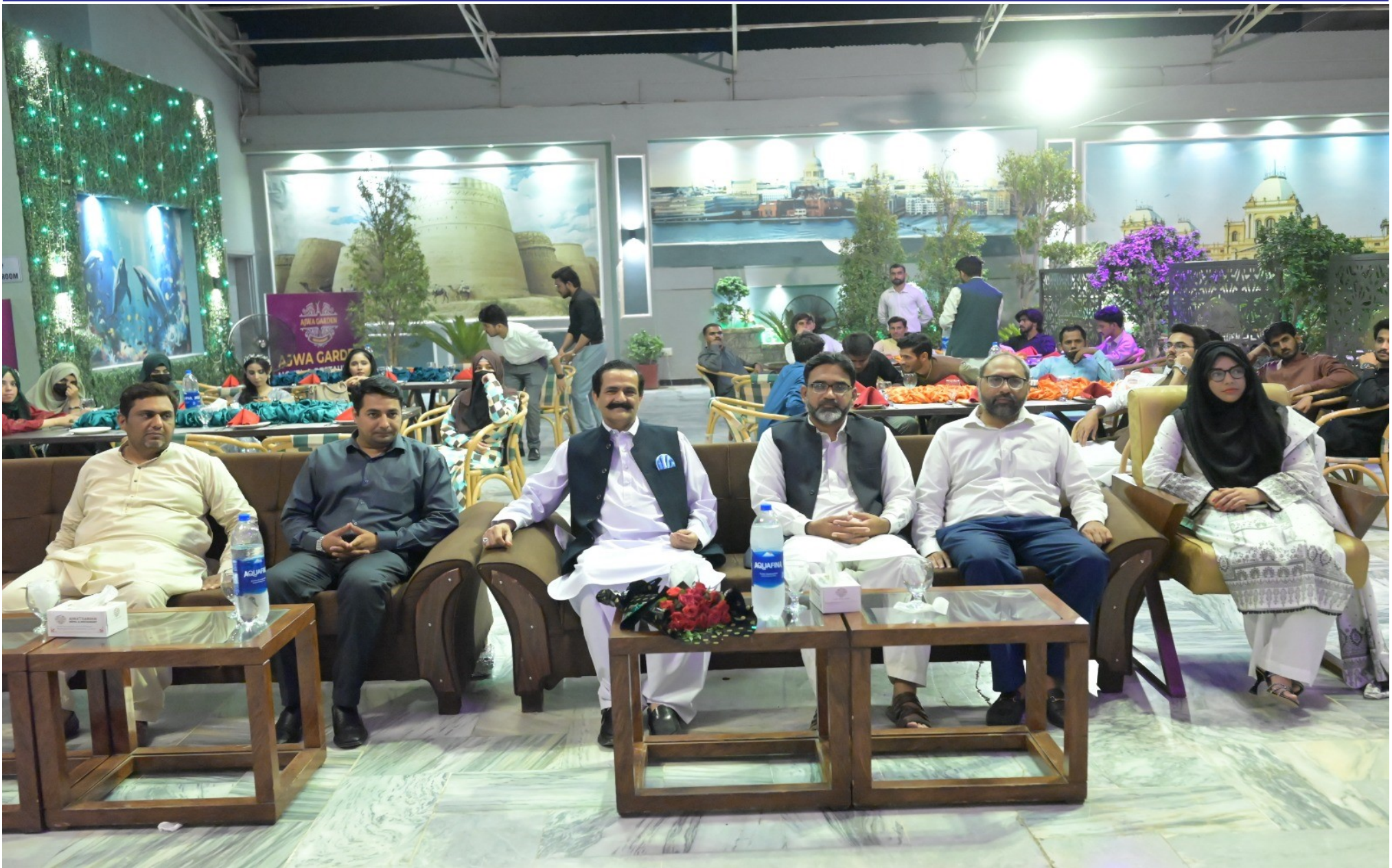
Farewell Party of BS Biotechnology Batch (2021-2025)